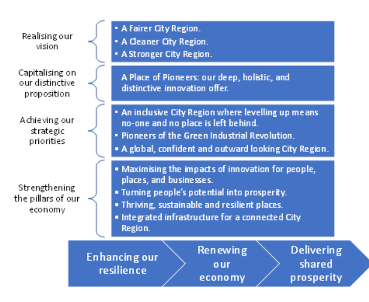
Figure 1: Plan for Prosperity summary (LCRCA Plan for Prosperity 2022)