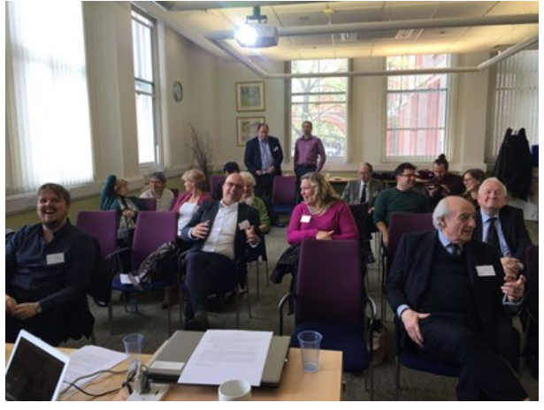
Delegates at the symposium in sessions and at lunch.

The event was supported by Brabners LLP and by a competitive award from the School of Law and Social Justice Teaching Development Fund.