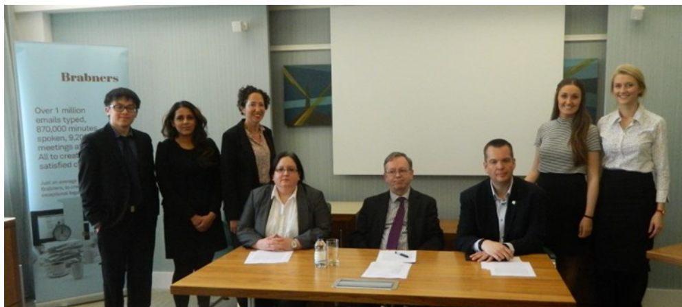
Members of both teams of mooters together with the panel of judges