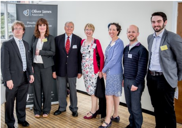
Organisers and speakers at the Equality Act 2010: 5 Years On conference