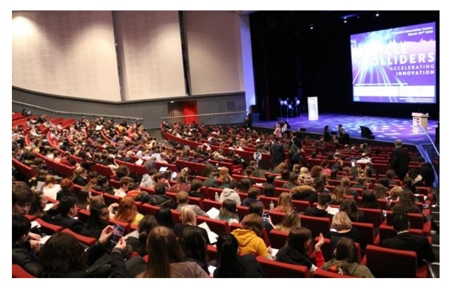
The Symposium took place at the Arena and Convention Centre Liverpool.

AVA Fellows based at University of Liverpool participated in the organization of an international Symposium on Particle Colliders -Accelerating Innovation which was held on 22 March 2019 at the Liverpool Arena and Convention Centre. The event showcased the science and technology opportunities related to the Future Circular Collider (FCC) study, a potential successor to the Large Hadron Collider and attracted nearly 1,000 delegates.