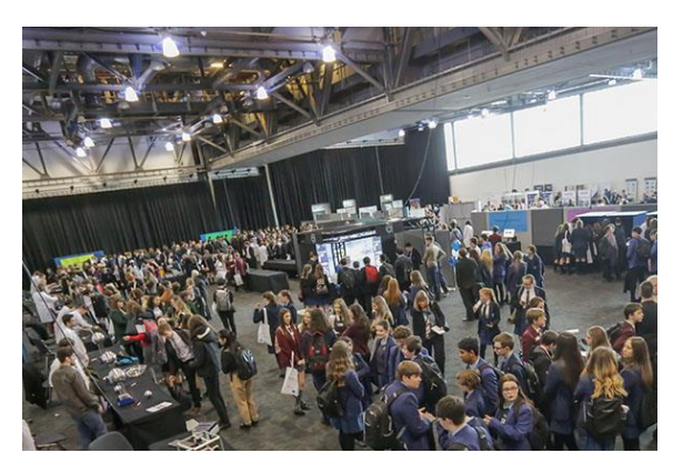
Exhibition Hall at ACC Liverpool.

In parallel to the industry exhibition, hands-on demonstrations engaged hundreds of high school students in the technologies behind FCC.