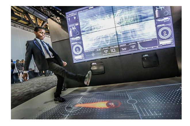
LHC interactive tunnel.

Volodymyr demonstrated a simple way for accelerating macroscopic size projectiles utilizing Gauss rifle principle – converting attractive force