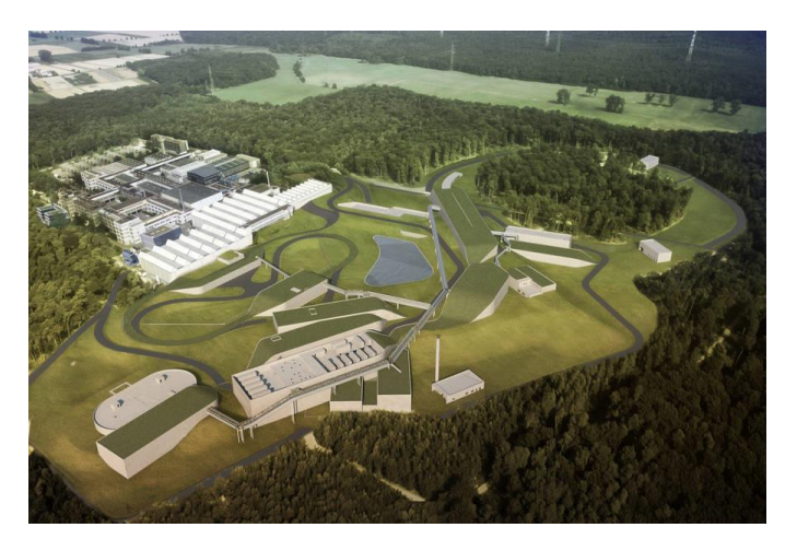
Visualization of the future FAIR accelerator facility.