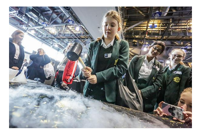
Cryo-experiments turned flowers into glass-like objects.

More than a dozen different activities, each one offered several times in parallel, were available to the high school students. This included the Plasmatron, an interactive game explaining the physics behind plasma accelerators, <u>salad bowl</u> accelerators showing how high voltages can be generated, the augmented reality accelerator acceleratAR that turns paper cubes into components of a particle accelerator, and cryo-experiments that turned flowers into glass-like objects...which were then smashed into pieces by the children, as can be seen below.