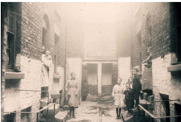
Figure 5. Insanitary housing conditions in late nineteenth-century Liverpool