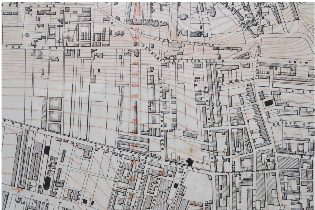
Figure 3. A section from Newlands' 1848 survey of Liverpool

The 1848 report provided prototypes for such widely divergent items as lamp posts with integral water hydrants and that also displayed street names and distances from the town hall to help cabbies correctly calculate their fares (Figure 4). Newlands further developed plans for the regulation of slaughterhouses, regular refuse collection, the construction of public baths, wash-houses and public urinals – the latter, of course, for men only