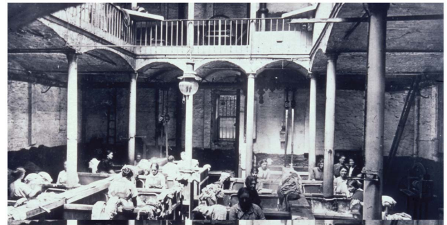
Figure 6. A late nineteenth-century Liverpool municipal wash house