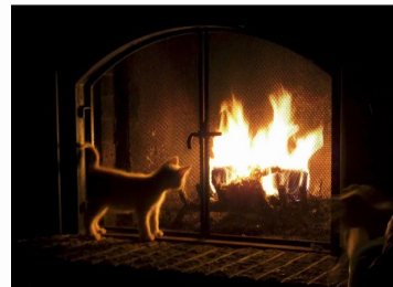
The heat appears.

If you live in a poorly insulated home, and many of us do, you could spend thousands this winter on energy bills. But our ancestors had many ways to keep snug at little or no cost. Now, thanks to modern infrared cameras and advances in environmental physics, we can understand how these methods work and measure how effective they are.