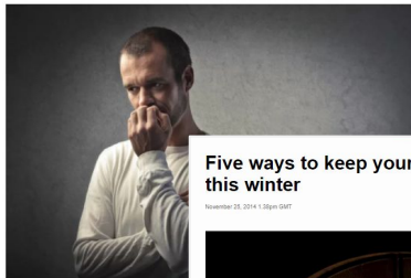
Anxiety, changes the body, too.

About one in 14 people experience impairment, abuse and suicide . In spi anxiety is lagging far bel problems – and many p condition.