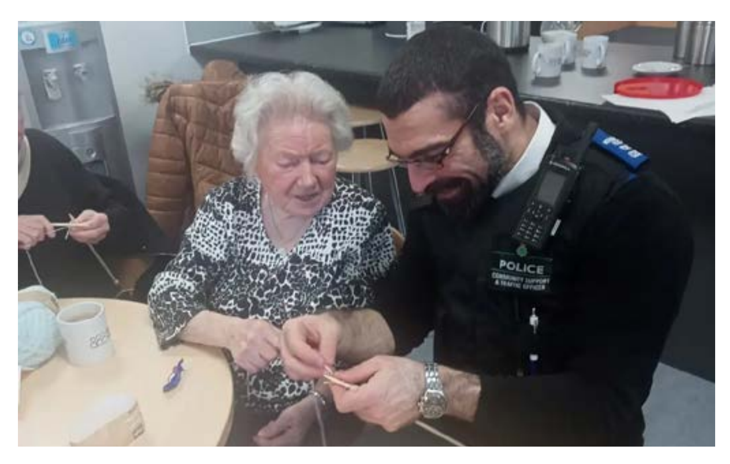
Knit and Natter at Bacon Butty Friday

This was a 6-month collaborative, sociallyengaged arts-based project in Croxteth to examine the community's perception of the area, to explore ideas around social mobility, and to recognise and celebrate the potential of the community and the individuals within it.