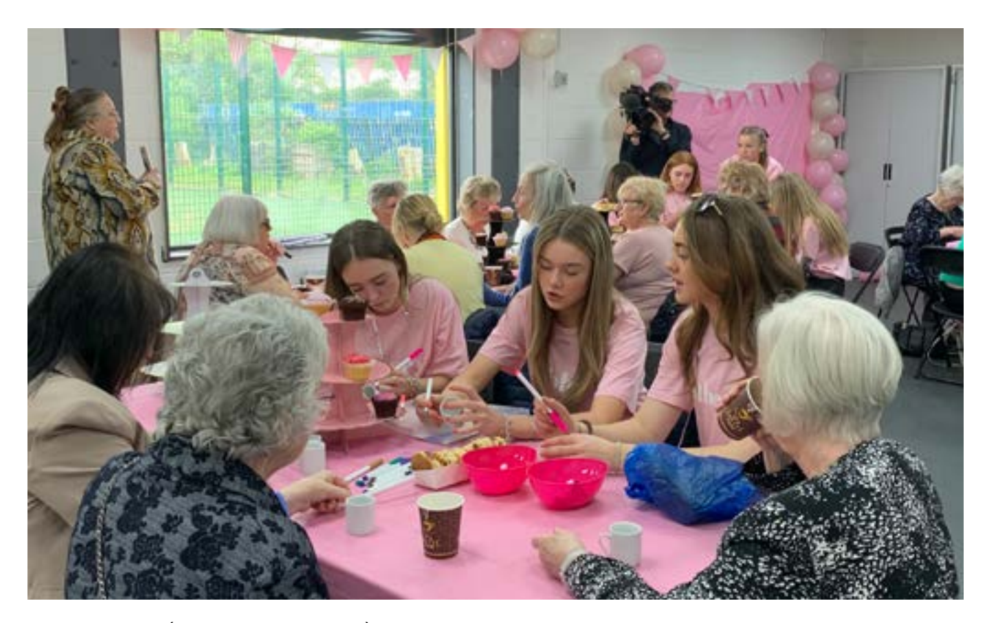
Croxteth Speaks