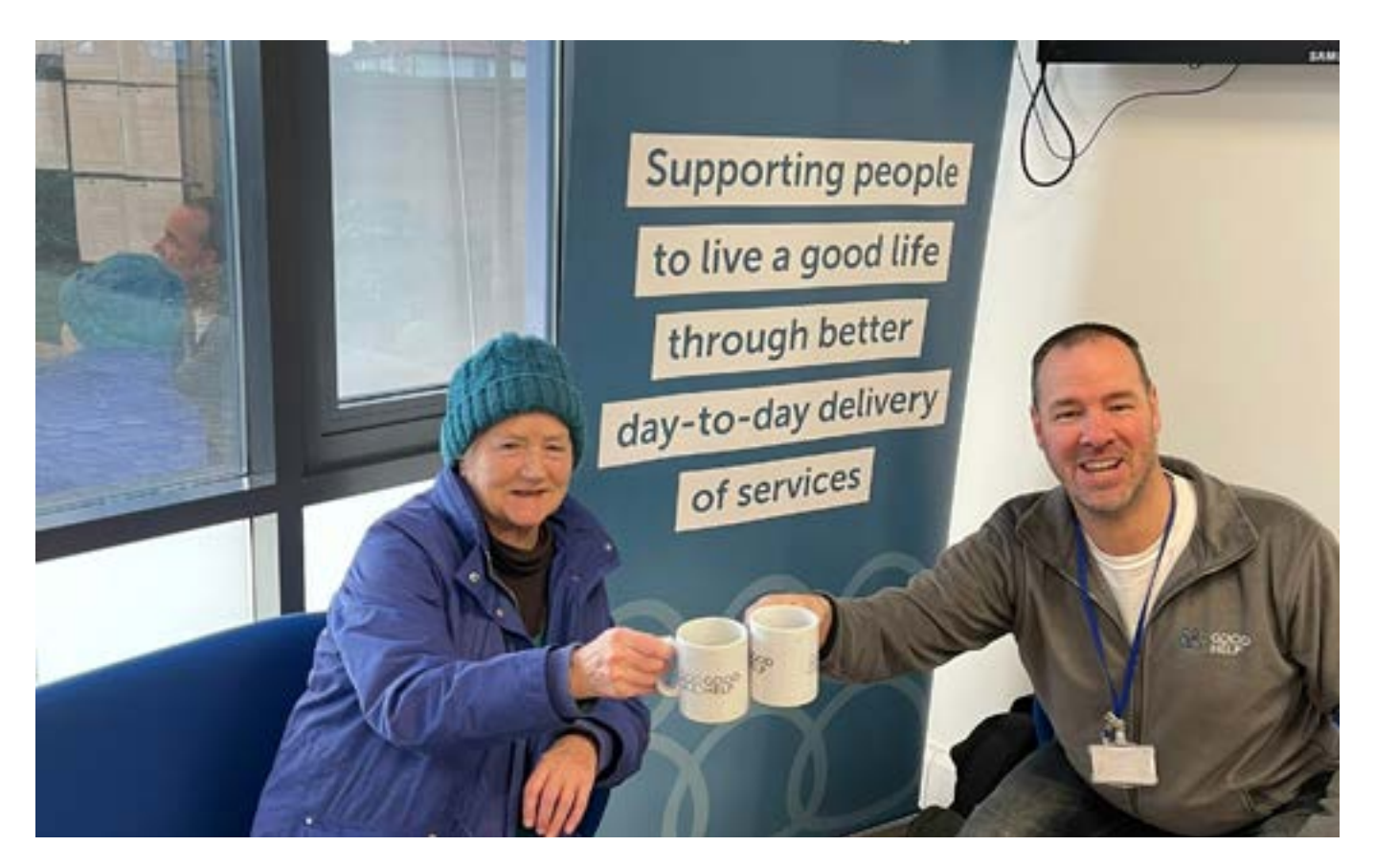
Croxteth Good Help Hub