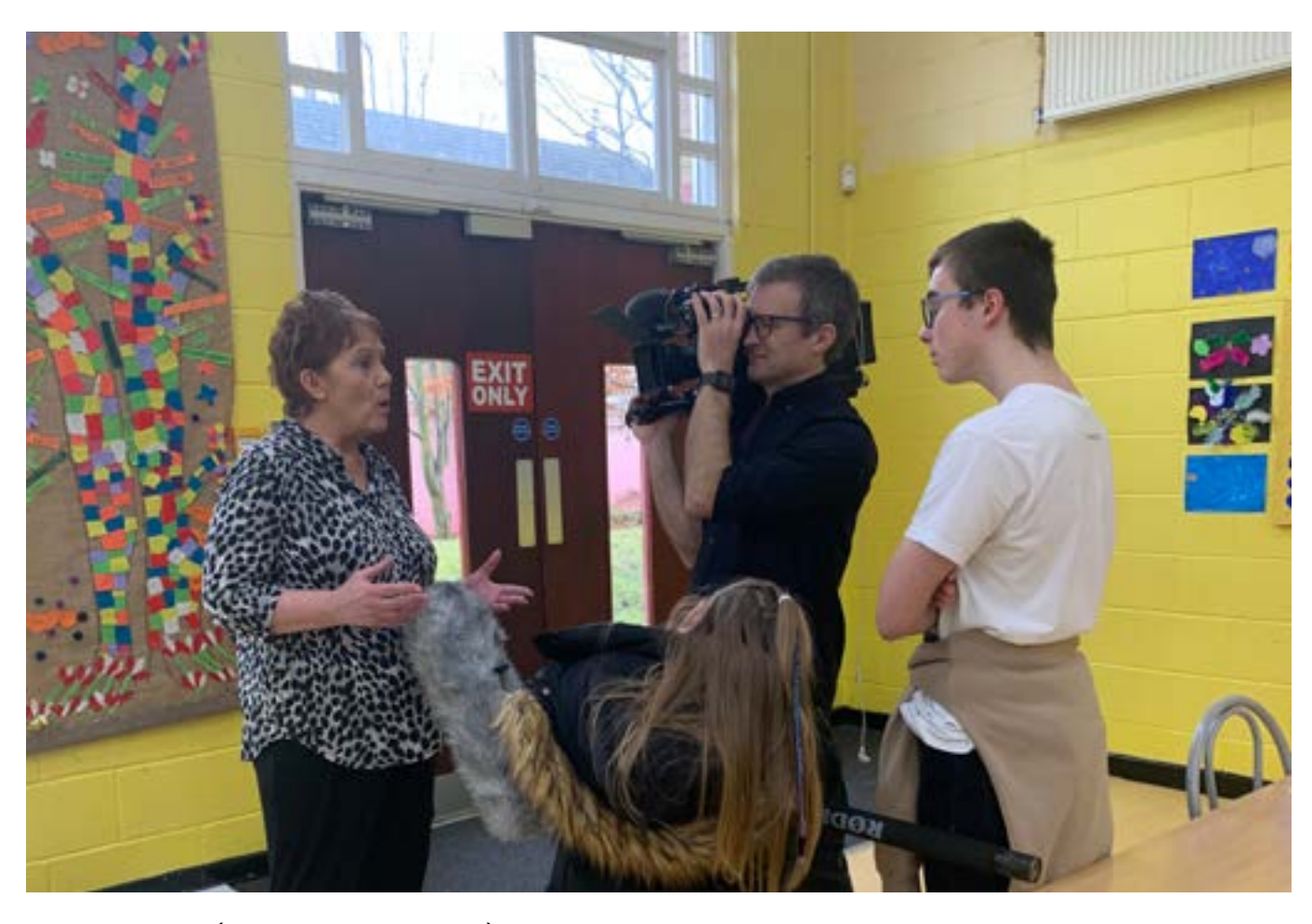
Croxteth Speaks

Overall, however, co-production was seen as a vital and innovative component of the pilot project.