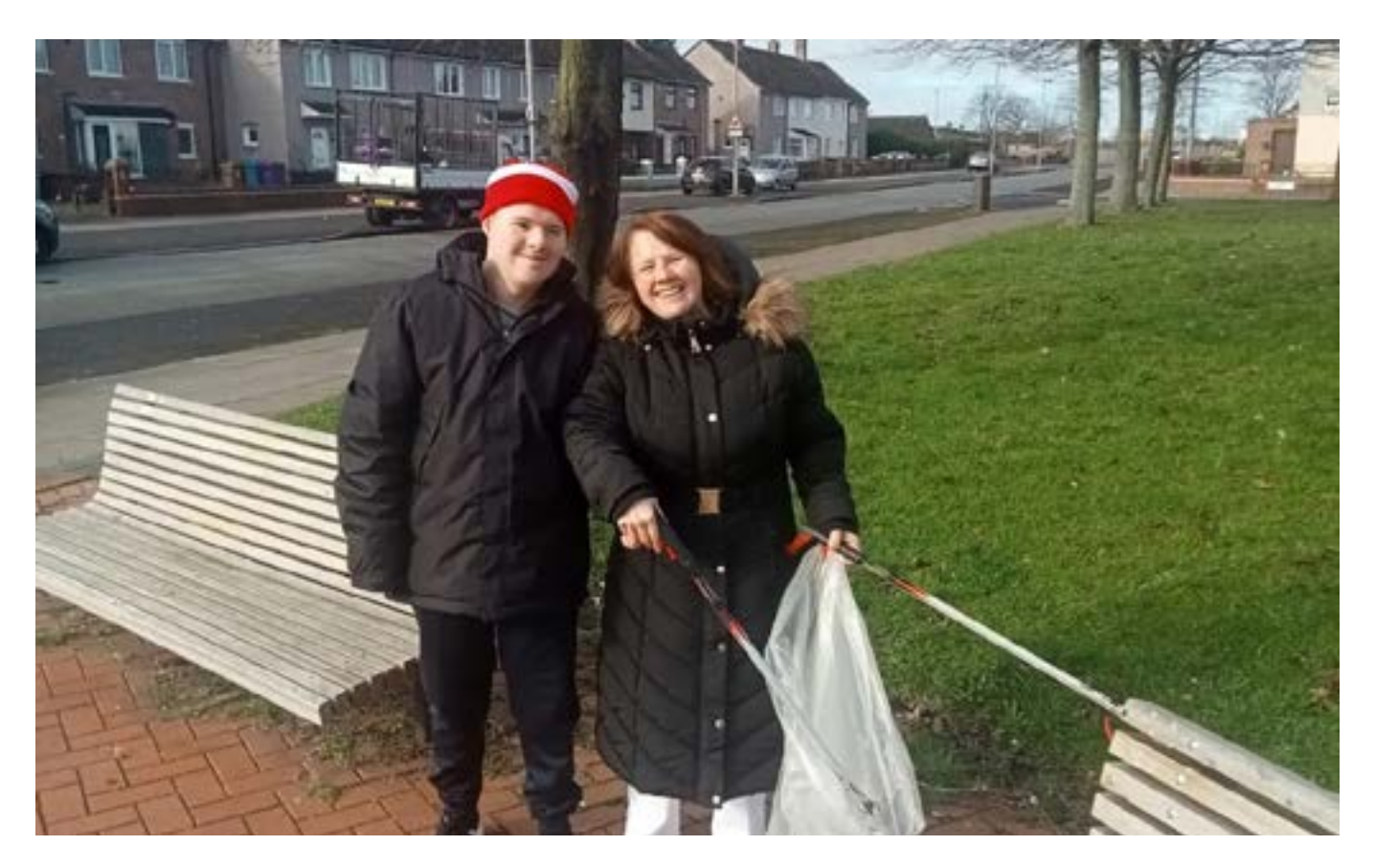
Community litter pick

This expansion of the Good Help Hub pilot is a commitment in its Corporate Plan, aligned to a core objective of unlocking potential and overcoming barriers to success by providing additional support to customers who need it, by proactively developing and supporting community-led initiatives, and by maximising the social value the organisation's overall investment generates.