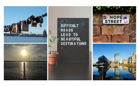
A look towards the future

The Liverpool City Region Combined Authority (LCRCA) and the Metro Mayor have established a package of measures to provide financial support as the COVID-19 crisis continues to expose vulnerabilities within the LCR economy. The emergency schemes can achieve maximum impact with the support of a coordinated public procurement response to address economic risk. In parallel, public procurement should be used as a vehicle to rebuild supply chains to address structural inequalities. The introduction of new policies must support and empower procurement decisions to bring about this change and address three key challenges.