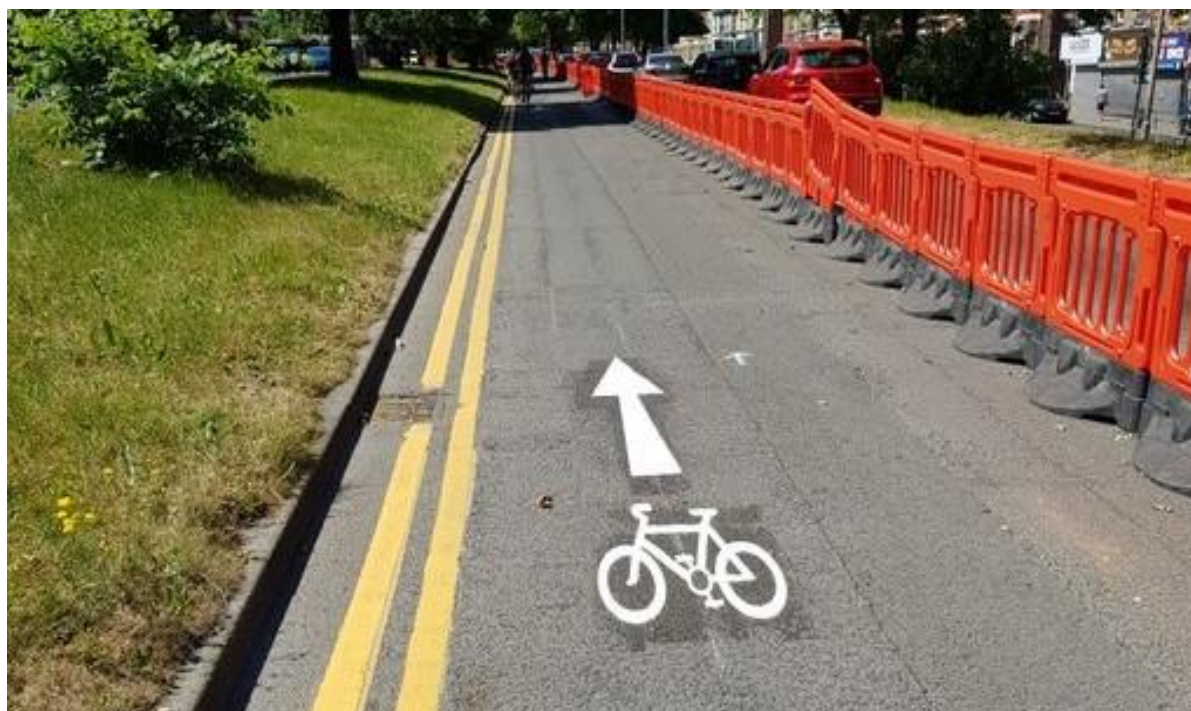
Cyclists rule OK!