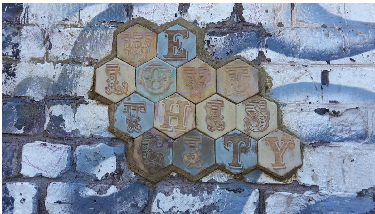
'We Love this City' in the Baltic Triangle

The scale of the emergency response to the crisis has demonstrated the extent of change that can be achieved in a short time on even intractable issues with an active state response, political commitment and community mobilisation. It is crucial after the health, economic, social and psychological costs the crisis has imposed that such a spirit inspires any recovery plan. We are not going back to an old normal. It will be as much about reimagining and renewal as recovery. Any plan must be up to the scale of that challenge. I called my book about the extraordinary renaissance of Liverpool city centre in the 2000s Make No Little Plans , adopting the words of the architect of Chicago, Daniel Burnham. He wrote: 'they have no magic to stir men's blood and probably themselves will not be realised.' I agree with him. We didn't make little plans in the face of prosperity. We shouldn't now in the face of adversity. Let us at this critical moment be that shining national and international light this city has always tried to be. Let us make big plans.