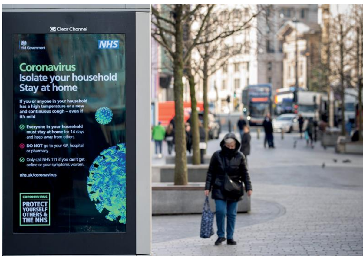
Social distancing in Liverpool city centre

Nevertheless, we should remain confident about Liverpool's future. History shows us its people do have a way of finding their path. The place, people and communities have come a long way in the last 35 years. Its economy is more diverse and more resilient now than then. In fact, Liverpool is arguably better placed to face this challenge than many other places precisely because of the economic, social and political knocks it has taken and the crises it has come through in recent years. They have created an enormous degree of resilience within the city which it has already been able to draw upon in this crisis. The public, private, voluntary and community sectors across the city have worked very well together to firefight the immediate crisis. So, while we must not underestimate the scale of the challenge the city now faces, equally we must not underestimate all the achievements the city has made nor some opportunities it could bring. Liverpool has a lot to build on, especially if it continues to pursue the right policies and priorities locally – as well as get the right response from Government. However, Beyond the Brink also stressed that despite its progress, the risks to poorer parts of the city and the threat of fiscal problems meant that the city would need good leadership and continuing commitment from both local and national government. COVID-19 has reinforced that need.