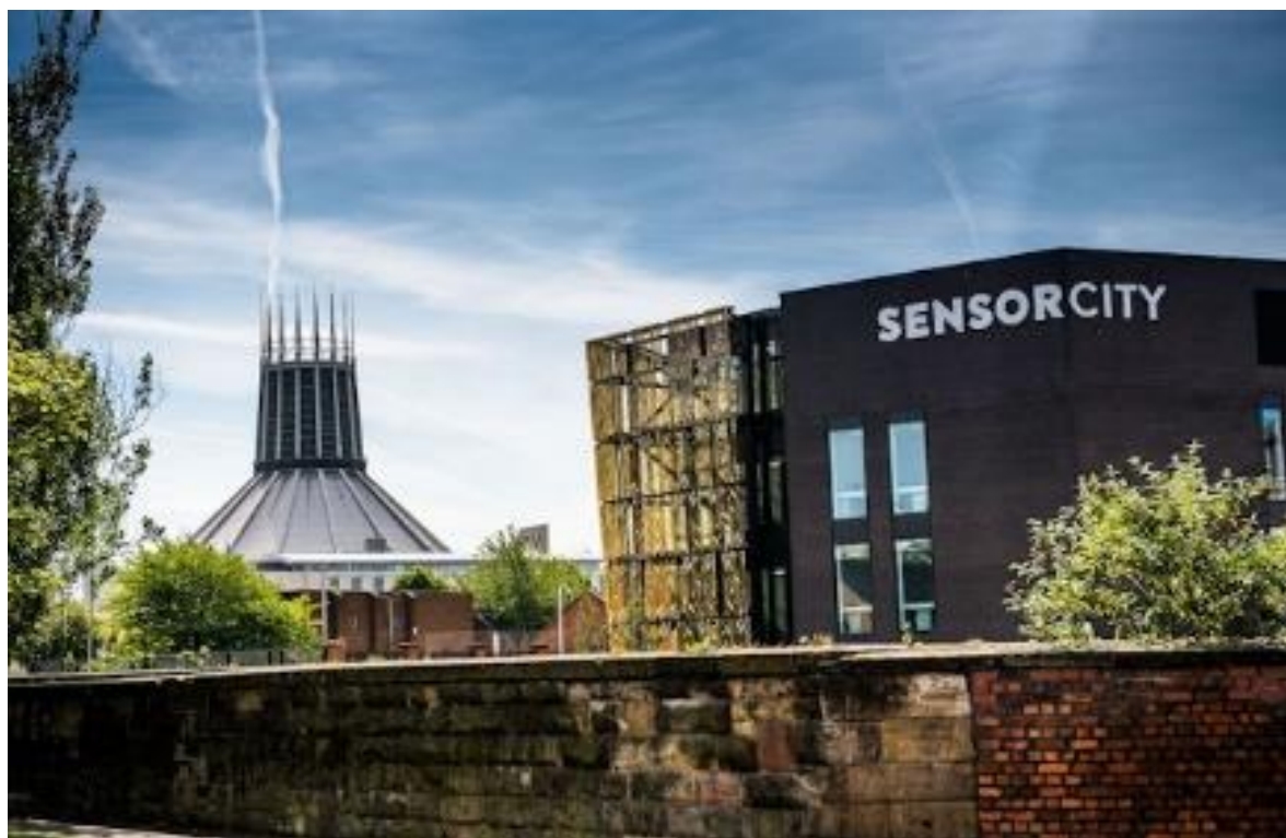
Science meets religion in Knowledge Quarter Liverpool

Legal and General and Bruntwood, which will be able to operate across the whole city region. This should lead to higher quality global property development and investment in future.