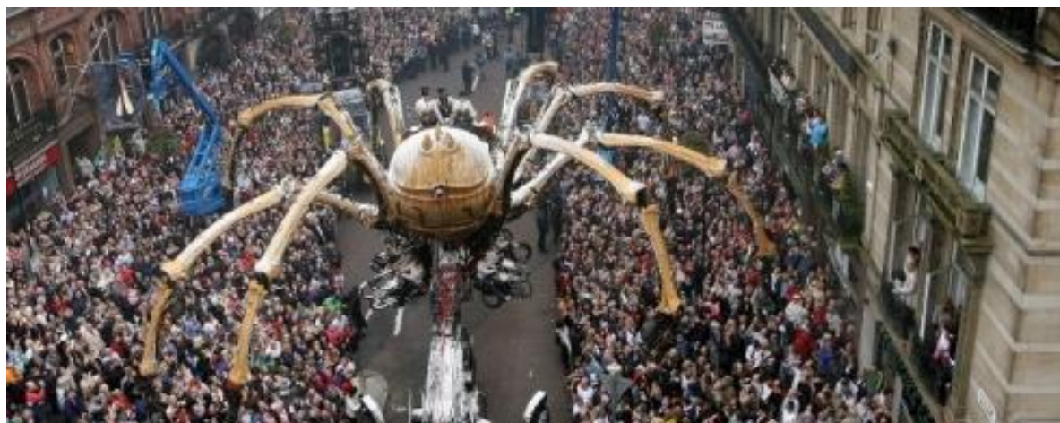
Capital of Culture's 'La Machine' captivates the Scousers

This internationalism speaks to the history of the city but also to the character and values of its people and should be a source of strength and inspiration in future in an increasingly parochial world. Liverpool may not be better than, but it is different to, other cities. It is not an English but a Celtic city. As the iconic banner on the Kop at Anfield proclaims 'We're not English, we're Scousers.' But this is a culture not just an attitude. And it comes with the maritime territory. The city's wide river and seaport; its history of immigrants and emigrants; its cultural blend of poets, philosophers, storytellers, flâneurs, comedians and musicians; its combination of global aspiration and intense local chauvinism – all make it different. It is a cosmopolitan, expansive place. Its people are simultaneously big hearted, open minded, generous, literate, if occasionally argumentative and querulous. In Liverpool you never quite know where the story is going which is why people always want to come and see it. It makes the place unique, attractive and ultimately investable. In an inward-looking world, the city must offer a home for everyone and remain a magnet for talent. It fits the city's imperial past as well as its international future as a great city trading in goods, services, ideas, culture and people. Liverpool is and should remain, as the leitmotif of our redefining Capital of Culture put it, 'The World in One City'.