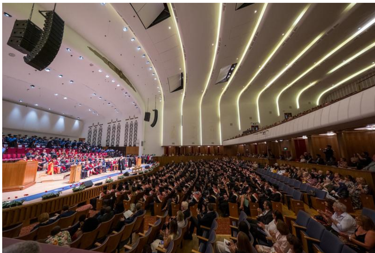
The big graduation day