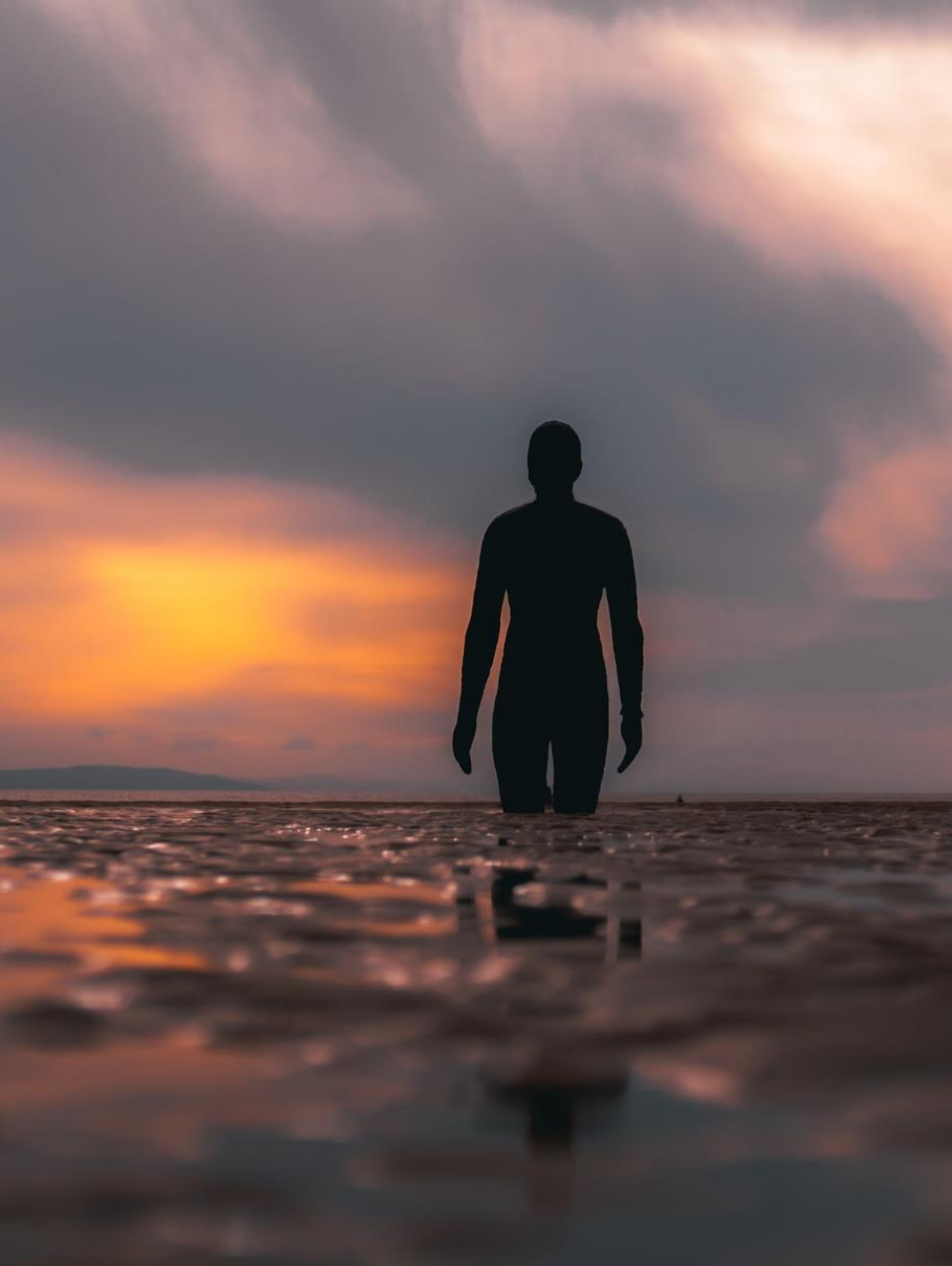
Antony Gormley's 'Another Place' ...in another time