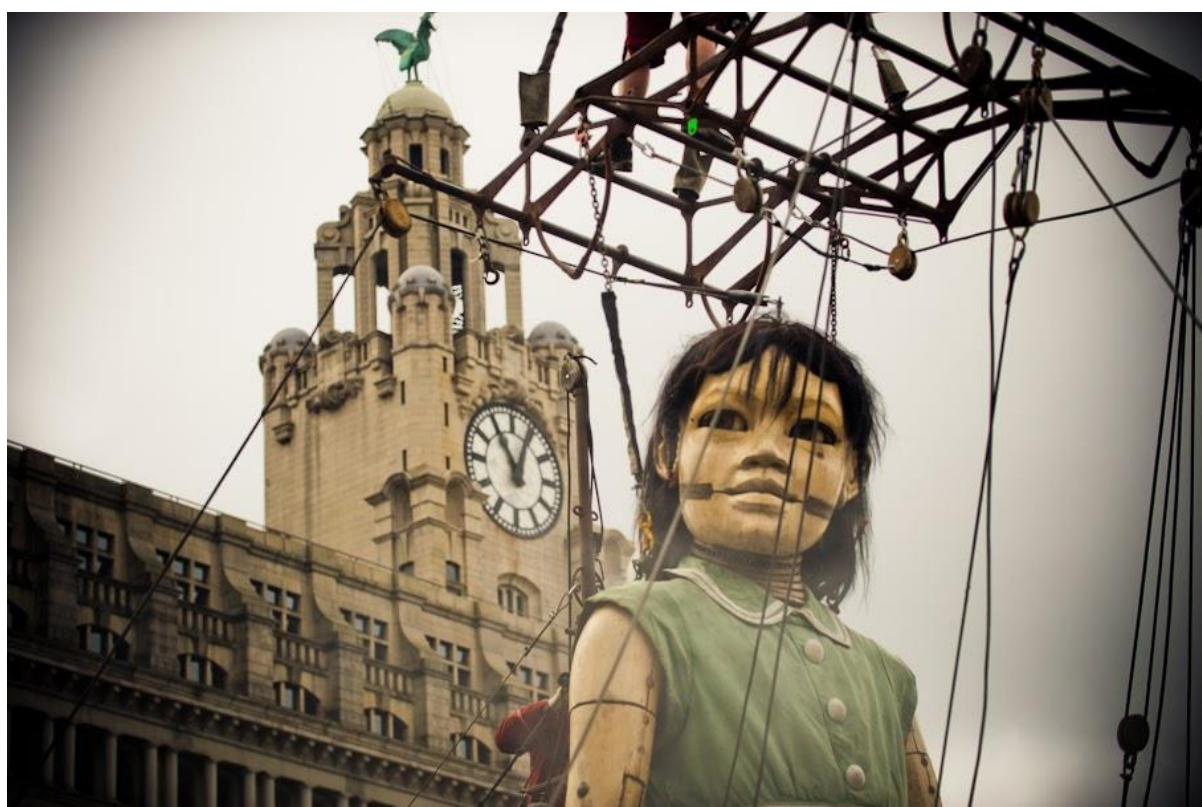
Giants come to Liverpool

games in either stadium. That will probably not happen again until 2021. As a result, both clubs and the city's facilities will receive much less income next season than they have in recent years. All this is crucial to the city since the football clubs are huge economic drivers. LFC has a turnover of £533m a year. Everton's is currently smaller at £189m, but it has a £500m investment programme planned for the Bramley Moore Dock stadium on the city centre waterfront. LFC has already postponed the redevelopment of the Anfield Road Stand for 12 months. The Bramley Moore development may also be slowed down. Partly for the city's football heritage, but primarily because of the scale of the clubs' economic impact on Liverpool's domestic and international tourism, profile, investment and confidence, it is crucial that safe solutions are found to get crowds back into the stadia.