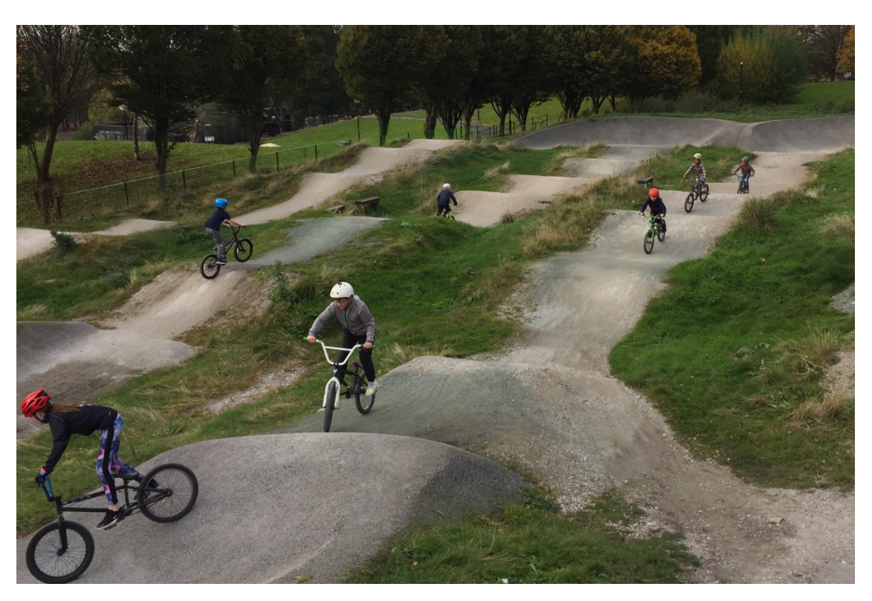
Young people at the BMX Box operated by Peloton Liverpool, a community initiative that promotes safe, accessible bike use in Liverpool

about the impact that the pandemic is having on their activities.