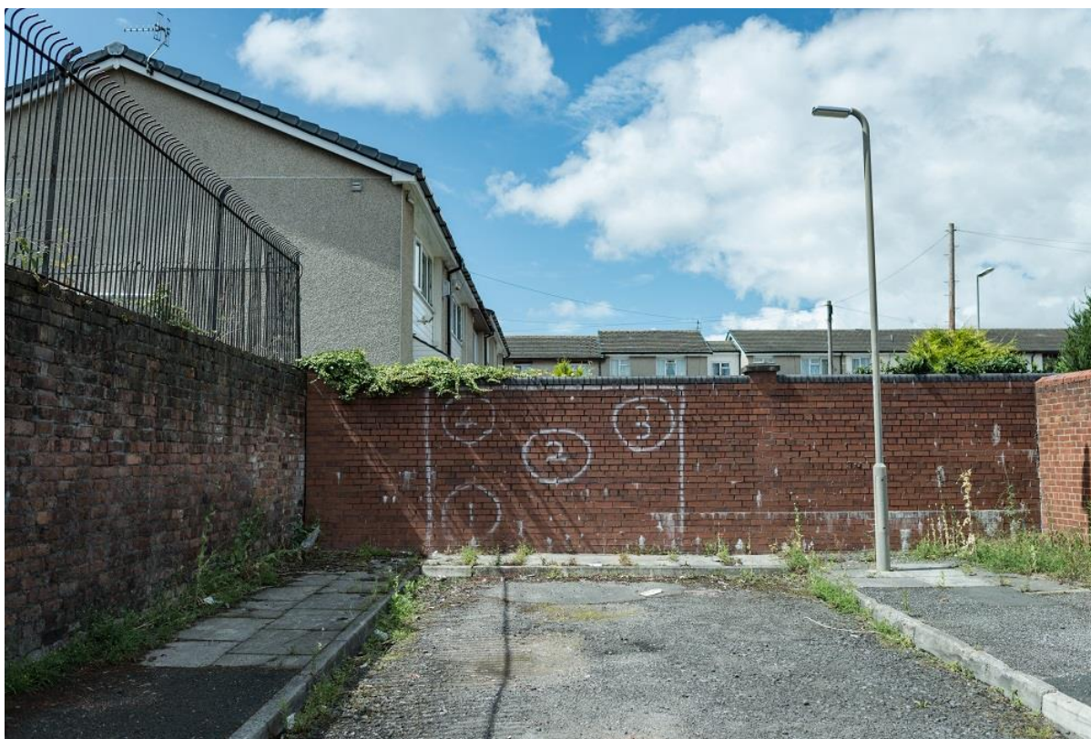
Urban goals – Toxteth, Liverpool

maintenance, resulting in loss of control and a possible reduction in skills, goodwill and quality. This situation has also led to increased costs for football clubs to play on facilities set by local authorities.