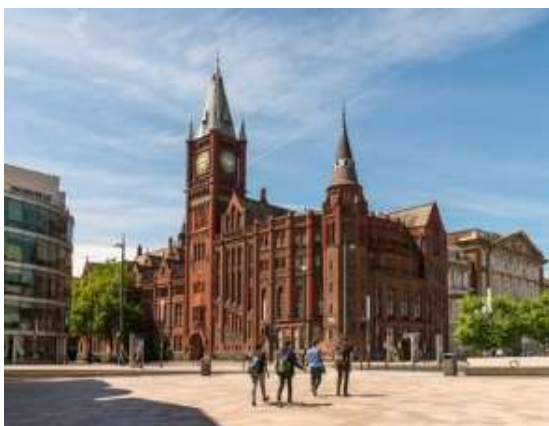
The University of Liverpool is an anchor institution within the City Region.

This policy brief considers how LCR and its HEIs can work in tandem to build an equitable and inclusive economic recovery following the COVID-19 pandemic. It makes six policy recommendations to achieve these ends across our people, our research, and our shared infrastructure. Together, these proposals not only provide a blueprint for some of the actions we can take now, but point toward an enhanced civic role for our HEIs in the future.