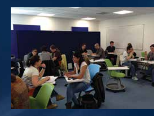
Researcher Skills School in Liverpool.