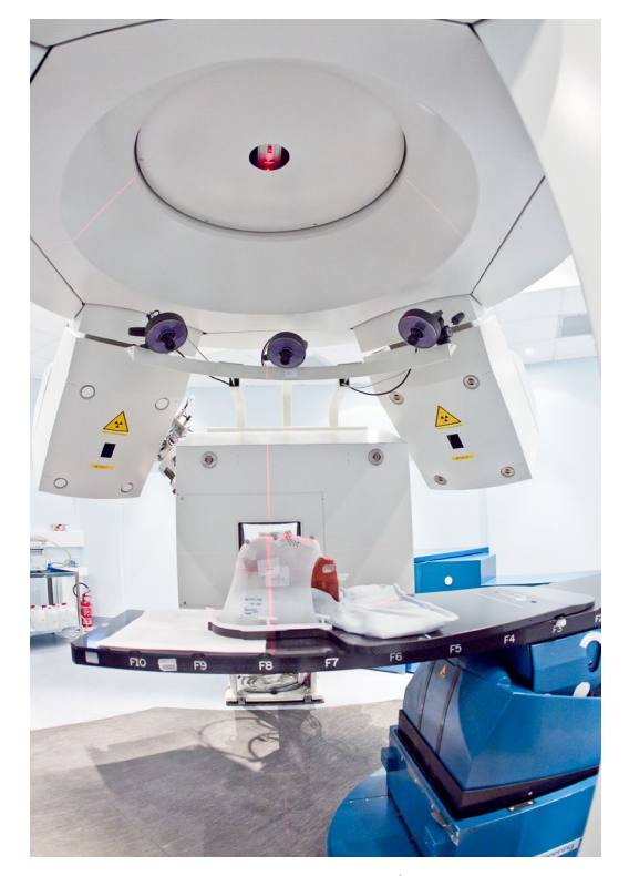
Treatment room at CNAO.

Recent clinical trials carried out in Japan for advanced or relapsing head and neck cancers has led to the approval of BNCT for clinical use with national insurance coverage. Finland has also seen similar results in treating head and neck cancers where other available therapies fail. BNCT represents a potential useful cancer treatment for tumor control, destruction. and significantly improving patients' quality of life.