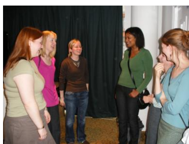
Students at 'Pop in the Archives'