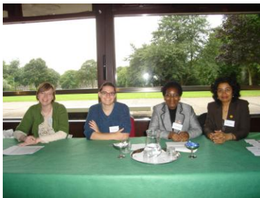
Four of our 2006/7 students welcoming arrivals at the reunion

To celebrate sixty years of postgraduate archives and records management education at the University of Liverpool a reunion was held at the Carnatic halls of residence on 12 th to 14 th July. Around seventy current and previous staff and students attended. The course began in 1947-8 and over 600 students have taken the course in its various incarnations. The current programme is still based in the School of History and is a Masters in Archives and Records Management. There is also an international pathway offered for overseas students. The programme also has links with Liverpool University Centre for Archive Studies (LUCAS) which is a non-academic body set up to promote archives and to strengthen archival links within the University and beyond.