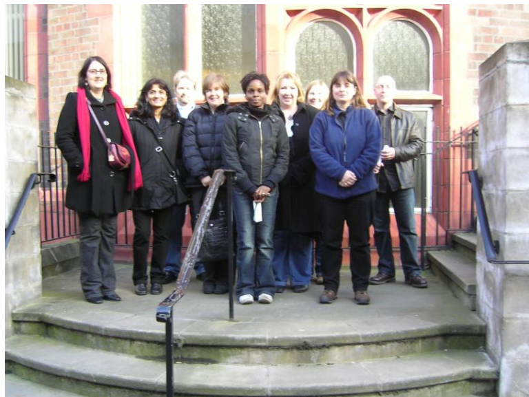
D/CPS: Records and Information Management students who successfully completed the distance learning programme over the summer

And finally we wish all students, colleagues and friends a very Happy Christmas and a peaceful New Year!