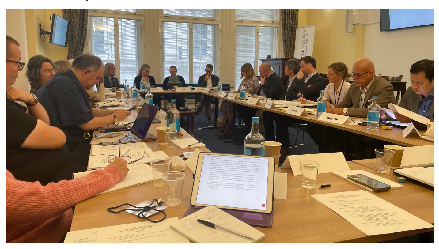
CLPU members and other participants at the Charity Law Workshop.