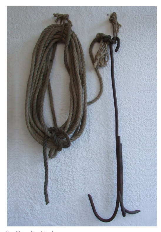
The Grappling Hook

The three new installations combine genuine historical items with digital technology to produce immersive, thought provoking artworks.