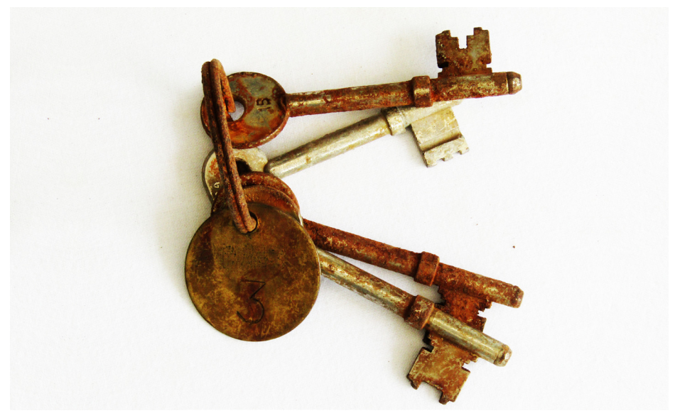
A Bunch of Crumlin Road Prison Keys

This installation constricts the audience into a small space that contains the actual keys that were used in the running of Crumlin Road Gaol. Combined with audio this work examines the notion of imprisonment. The work combines actual historical artefacts with contemporary art pieces encouraging the audience to examine the ideas around the themes of imprisonment/confinement and freedom/release.