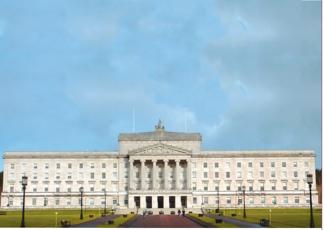
Stormont Parliament Buildings

The bronze hands for the original Good Friday sculpture and the new hands are mounted on bases cut from Mourne Granite, the same material that forms the steps to Stormont Parliament Buildings in Belfast. The use of a granite stone reflects the fact that in ancient times there was a sense of immense power and permanency about a large rough shaped rock. In mythology, and in the contemporary era, people, chieftains and monarchs touched or sat on a stone to pledge a better future. This centrepiece will be accompanied by other sculptures, paintings, prints and three important new audio visual installations reflecting the search for peace and its wider context over the last twenty years.