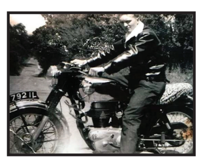
Service Number: 24166660