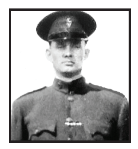
Service Number: 7758