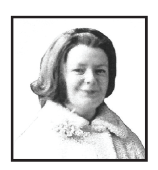
Civilian 11th August 1949 - 7th April 1976