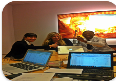
20 MSc students/year >200 graduates