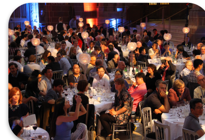
Regular seminars, workshops