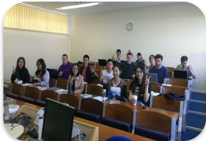
UG graduates/year 210 Math with Finance 40 Actuarial Math