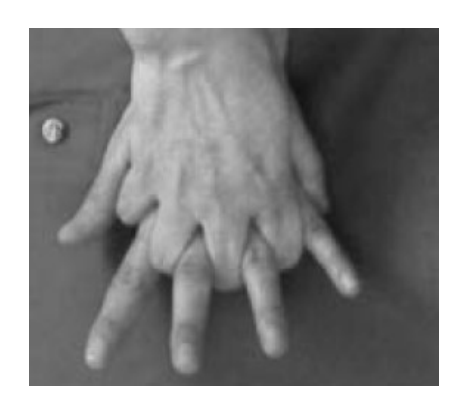
FIGURE 4: HAND CLASP