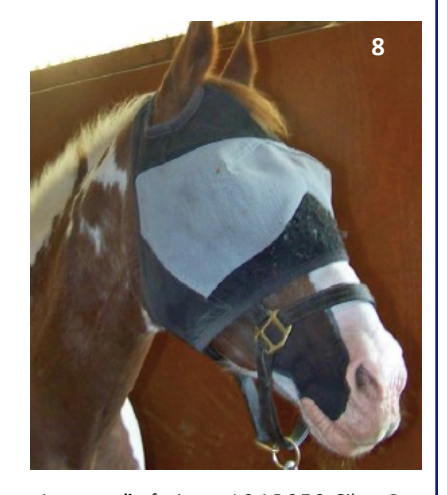
<u>Image credits</u> for image 1,3,4,5,6,7,8: Gilger, B. (2010). Equine Ophthalmology-E-Book. Elsevier Health Sciences.

Although it may appear as if your horse has something stuck in their eye if they present with a closed eye and lots of discharge, foreign bodies are actually quite rare in horses. However, any foreign body in the eye can cause serious trauma and risk loss of vision (and potentially loss of the eye) and warrant immediate veterinary