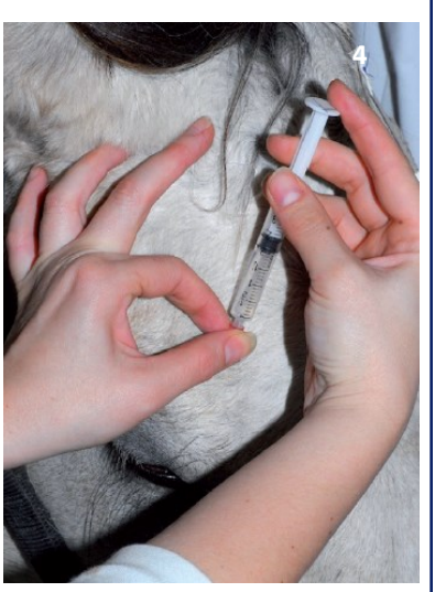
Continued Over ....