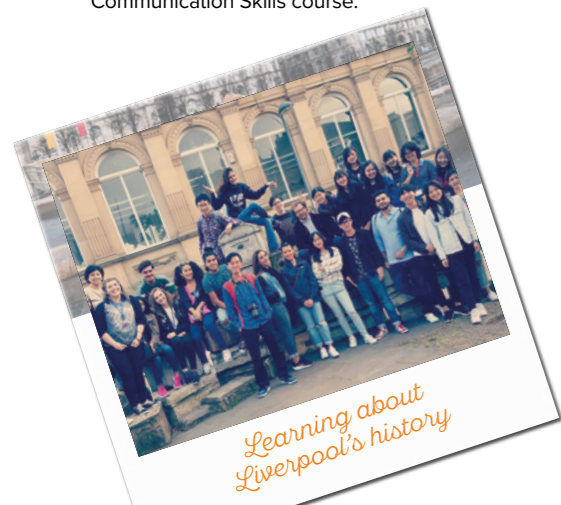
Learning about Liverpool's history