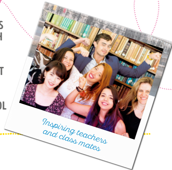
Inspiring teachers and class mates

THE UNIVERSITY OF LIVERPOOL INTERNATIONAL SUMMER SCHOOL IS AN ACADEMIC PROGRAMME WHICH DRAWS ON THE EXPERTISE WITHIN OUR THREE RESEARCH INTENSIVE FACULTIES TO OFFER YOUR STUDENT THE CHANCE TO ENGAGE WITH A WIDE RANGE OF SUBJECTS WHILST EARNING UNIVERSITY OF LIVERPOOL CREDITS AND ECTS.