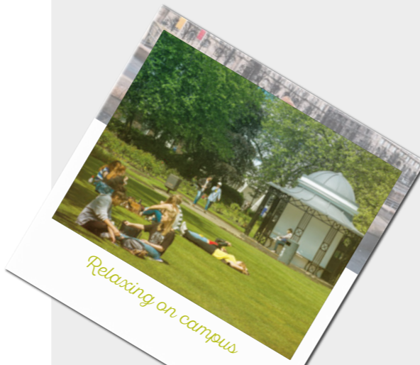
Relaxing on campus