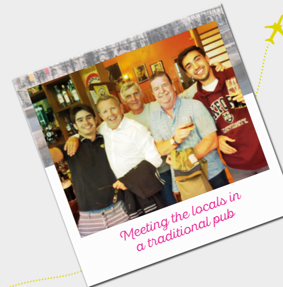
Meeting the locals in a traditional pub