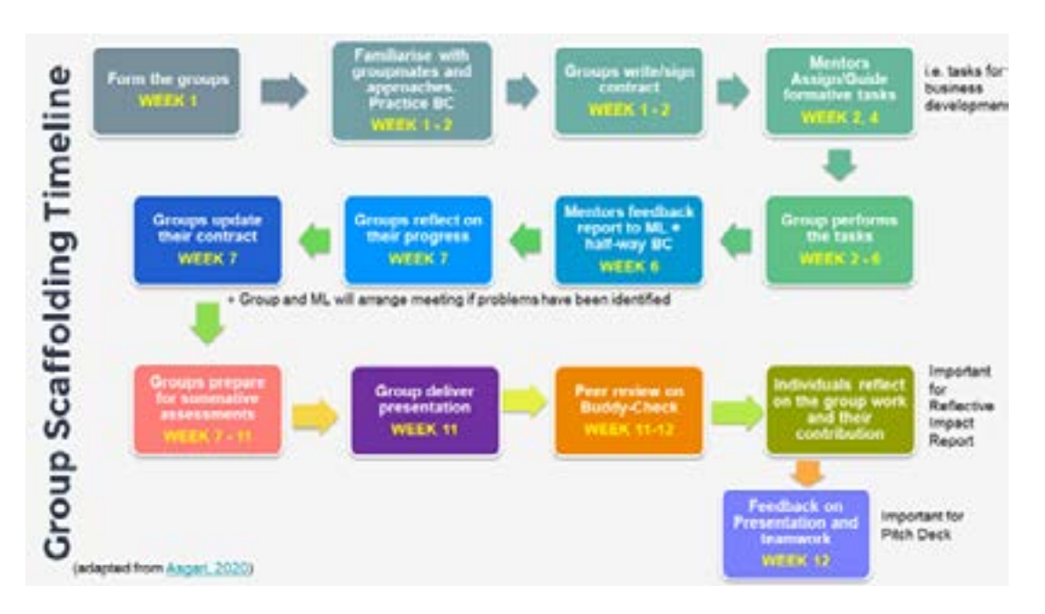
Figure 1 Course Map Dr Giulia Rampone, School of Psychology 'ULMS252 Entrepreneurship'

Implement peer evaluation as a component within your overall course design – not as an after-thought or last-minute addition. Creation of <u>course map</u> can be a useful approach to plot out and communicate an integrated approach.