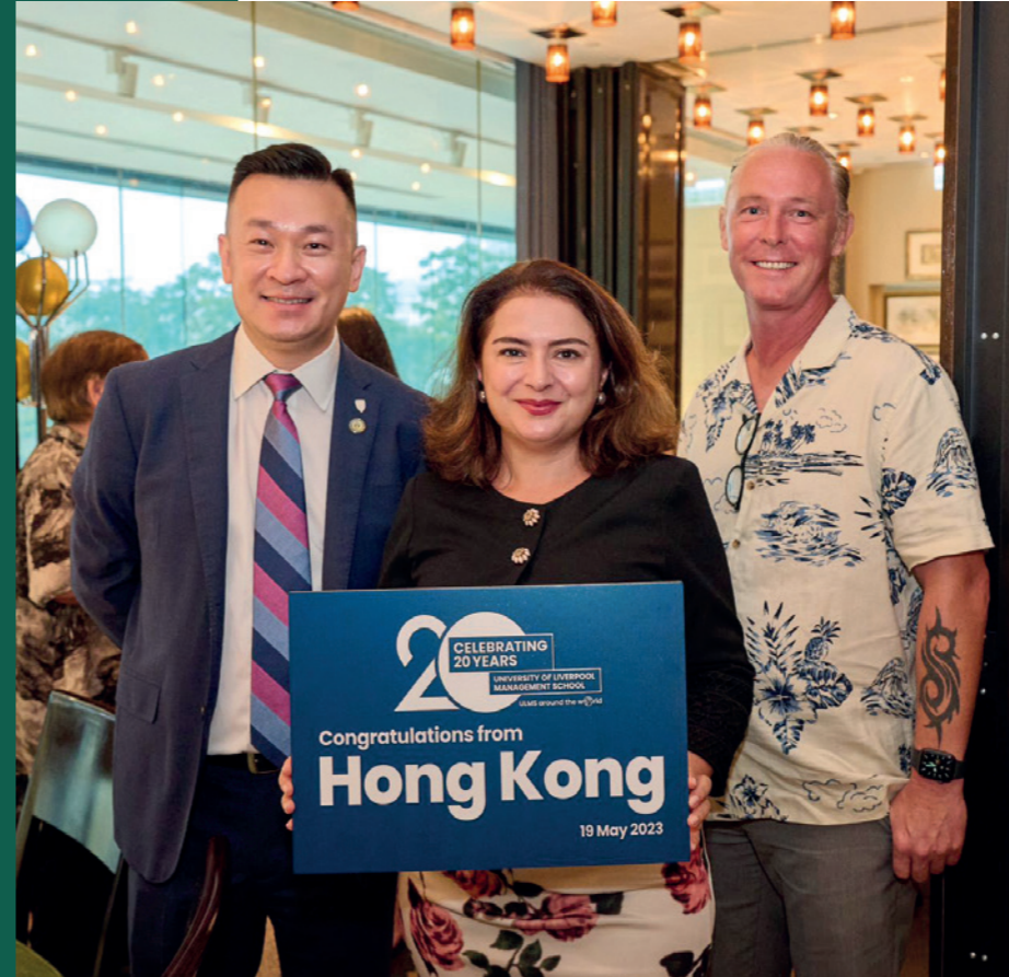
Attendees at recent University of Liverpool Management School 20th anniversary event