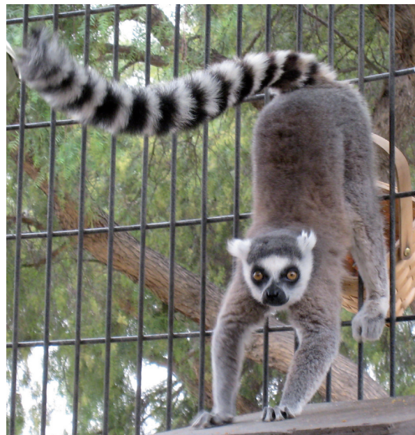
Figure 1. Ring-tailed Lemur ( Lemur catta ) using perianal glands for scent marking. (Photograph by Alex Dunkel/Visionholder).

In work published recently in BMC Evolutionary Biology , Boulet and colleagues [1] have advanced this field by