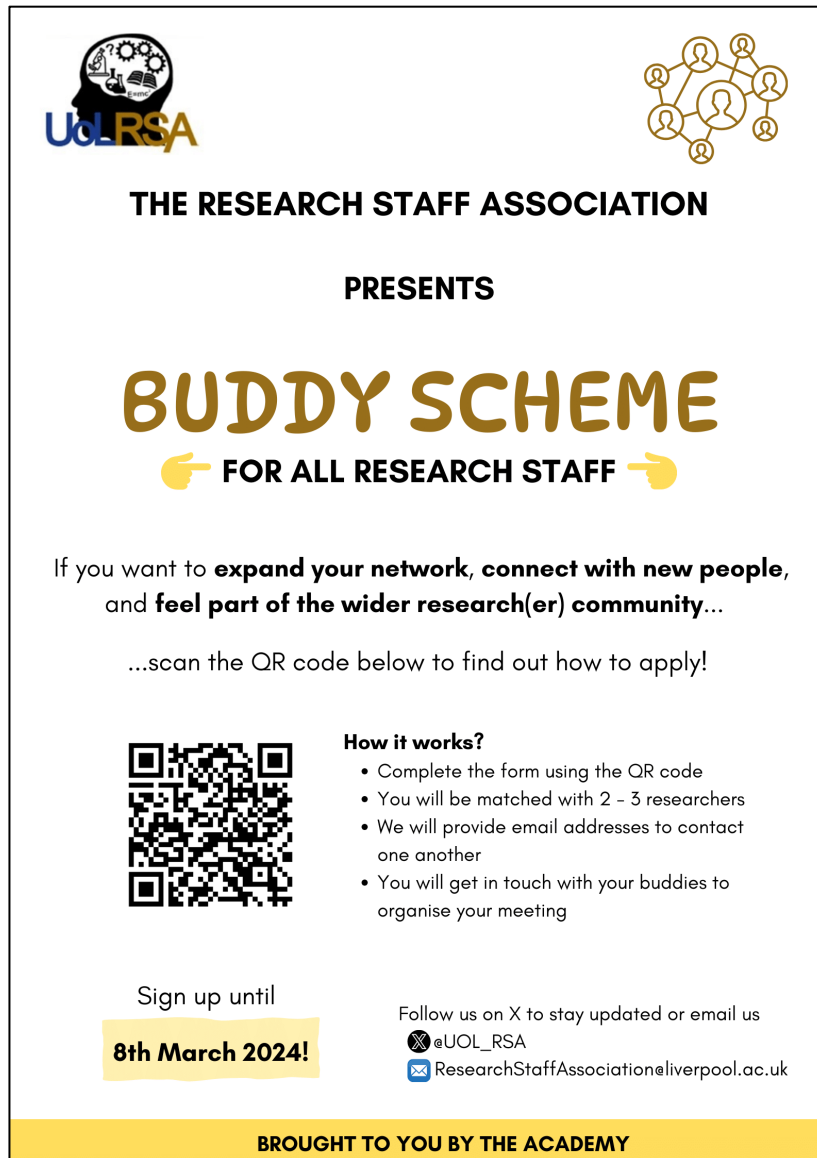
Figure 1. Flyer developed for the fourth round of the Buddy Scheme and posted around the faculties and the University Campus.